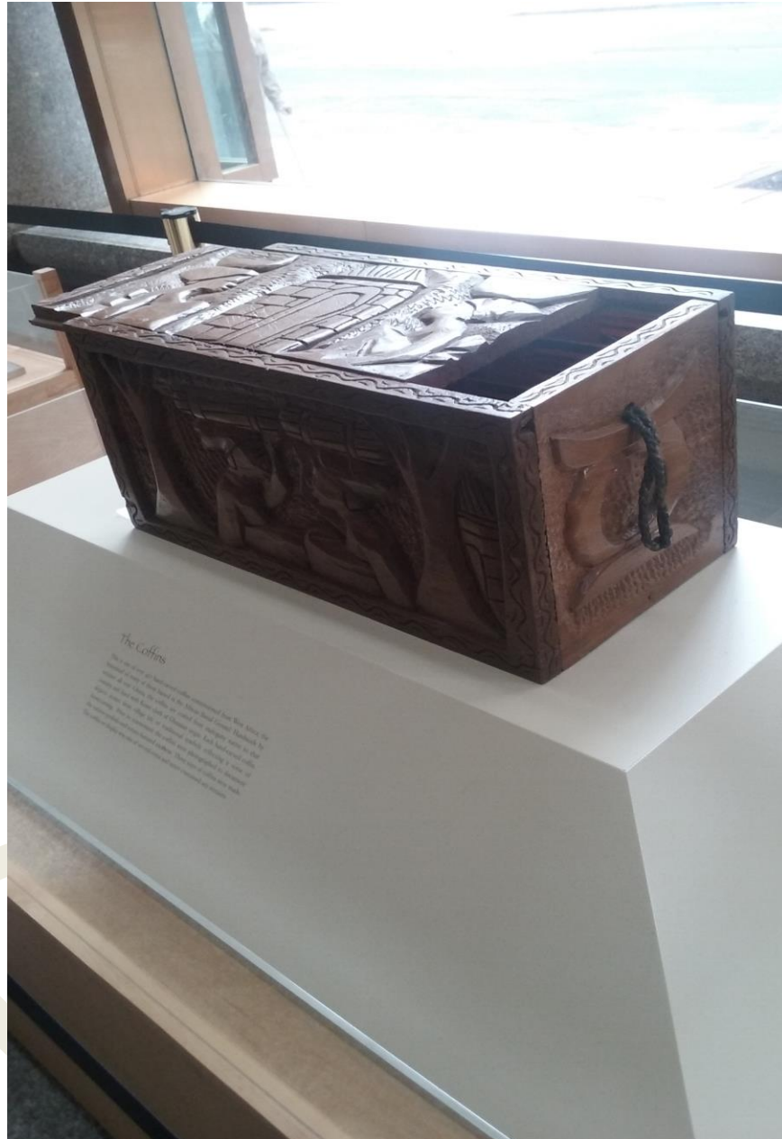
Sample coffin designed by Ghanaian artisans for New York African Burial Ground Ancestral Remains